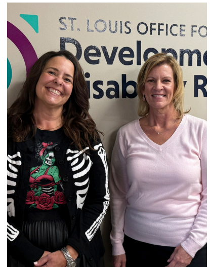
Representative Elizabeth Fuchs

We support this work by hosting legislative coffees, visiting the Capitol, and inviting lawmakers to our office to learn more about our services. These efforts help protect the public investments that make our work and our community's progress possible.