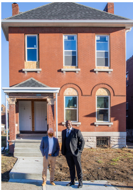
Property under renovation in partnership with Tabernacle Community Development Corporation

In FY25, our funding priorities reflected this commitment: supporting collaborative programs, paid employment training that guarantees a living wage, and capital improvements that enhance accessibility and independence. These targeted investments help ensure individuals with developmental disabilities are not just supported, but included and empowered, in every part of our city.